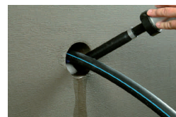
2. ... pipe is sealed...