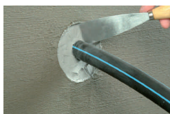
5. ... comfortably ...