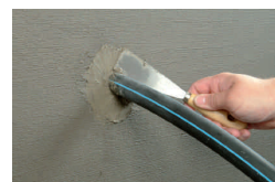
6. ... and permanently.

KÖSTER KB-Flex 200 Sealing Paste can be applied on all mineral construction materials, e.g. concrete, masonry, mortar and plaster. It will also bond to ceramics and plastics such as PVC, polyethylene and polypropylene. The substrate can be dry, moist or wet. It must be sound, free of grease, tar and oil as well as dirt and other debris.