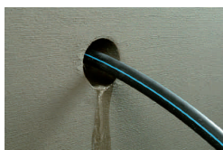
1. A leaking ...

KÖSTER KB-Flex 200 Sealing Paste is impermeable against water and vapour.